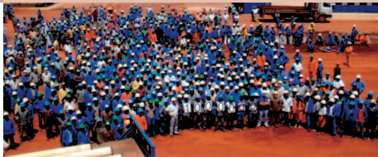
Celebrating the achievement of one million hours without a lost-time incident on the Temane Field Development Project, Mozambique.

Linking our process expertise and our project execution/estimating skills and IT tools, we apply value improvement practices during the early phases of a project, where they deliver the greatest benefit.