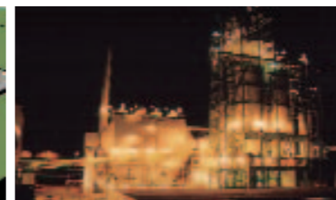
Chrome International Chromium Chemicals Plant South Africa