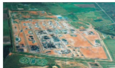
Mossgas (PetroSA) Lower Aromatics Distillates South Africa