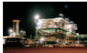
Sasol Temane Field Development Mozambique